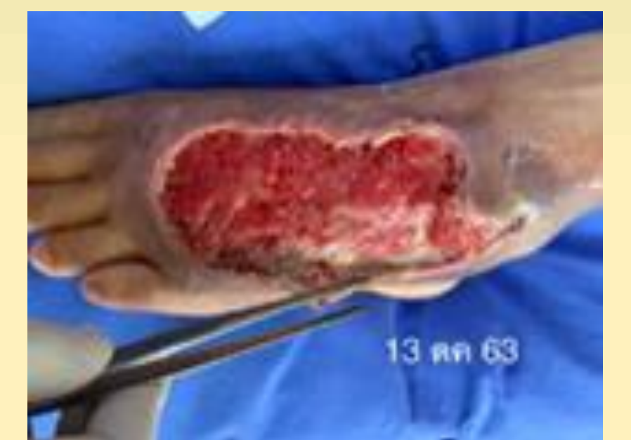
Day 4 – Week 2